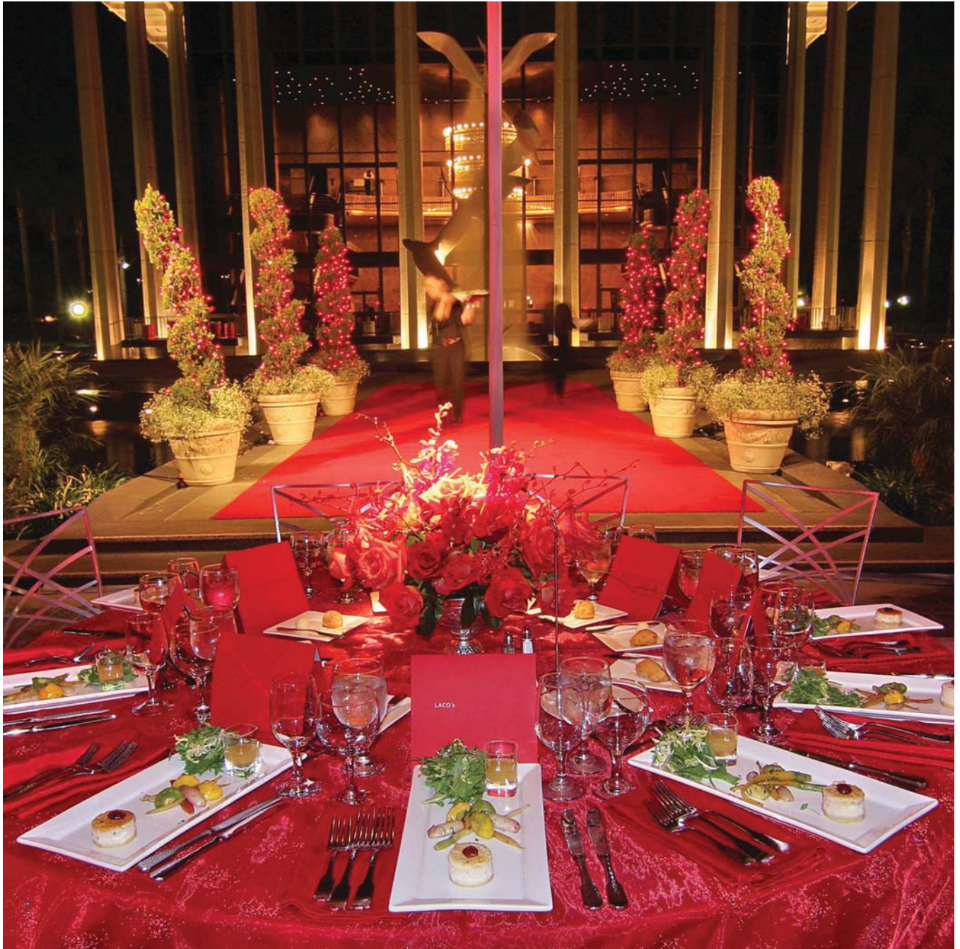
Ambassador Auditorium, September 27, 2008