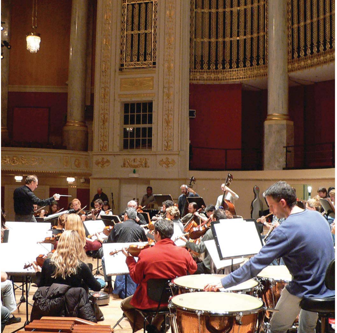
LACO rehearsing, Konzerthaus, Grosser Saal, Vienna.