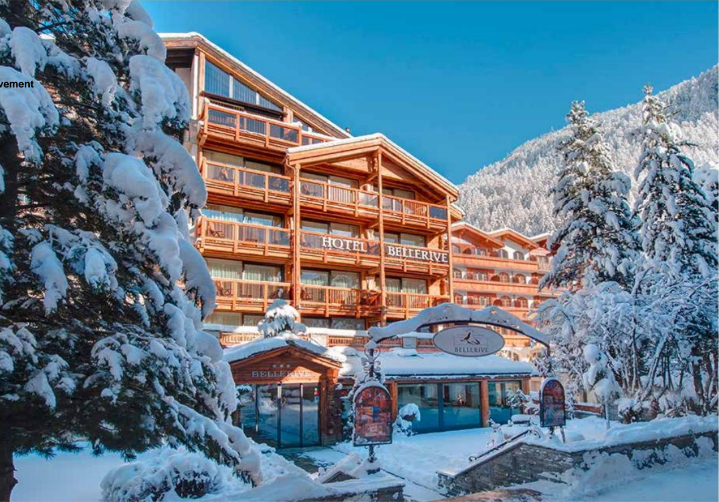
The Hotel Bellerive performs best in the evaluation of its online presence.

The report from the HES-SO Valais shows in which areas Zermatt accommodation providers generally perform well, in which areas they have improved compared to the previous year, and where there is still room for improvement. The highest marks go to the design of their websites.