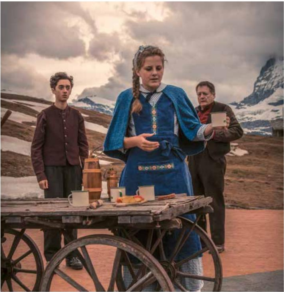
16,000 spectators attended "Romeo and Juliet on the Gornergrat".

Further information: www.freilichtspiele-zermatt.ch