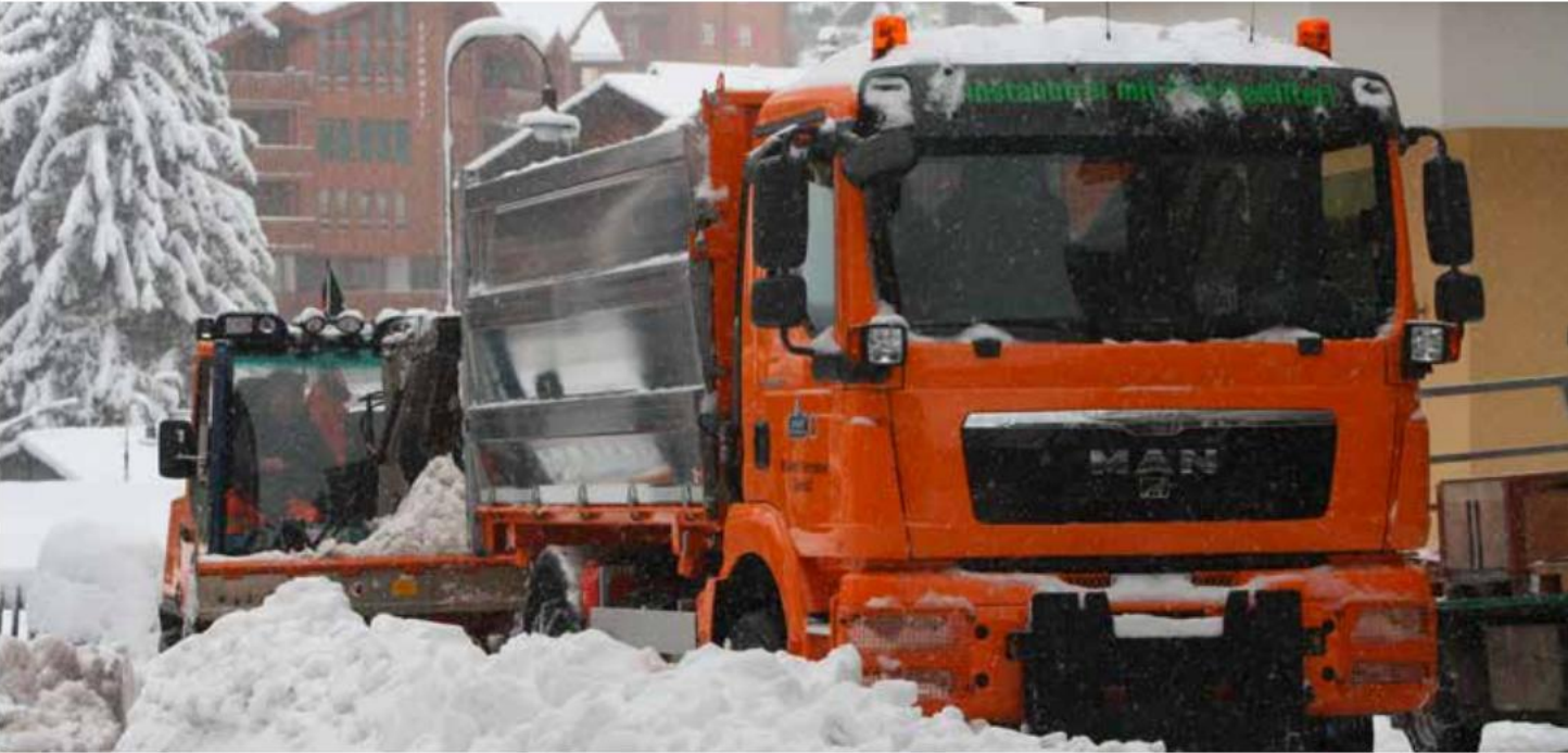
After 9:00 a.m., dumping snow and ice on public roads and paths is prohibited. Violators may be fined. entail.

Mission The Technical Services team will utilize all human and mechanical resources to ensure the best possible conditions for safe winter use of the roads and paths.