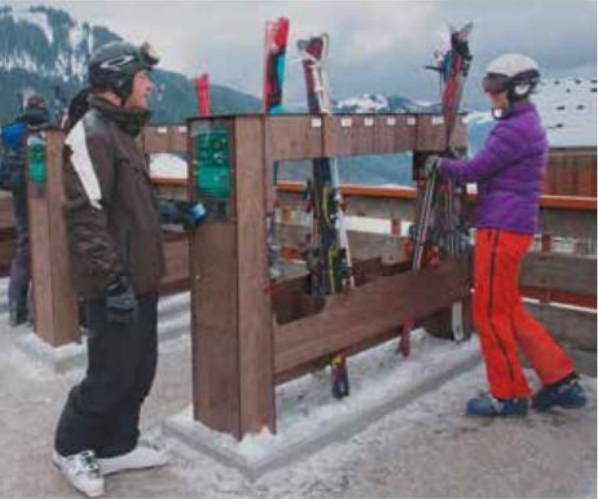
More than 500 state-of-the-art ski and snowboard storage spaces have been installed at the top and bottom stations of the Sunnegga funicular (topic photos).