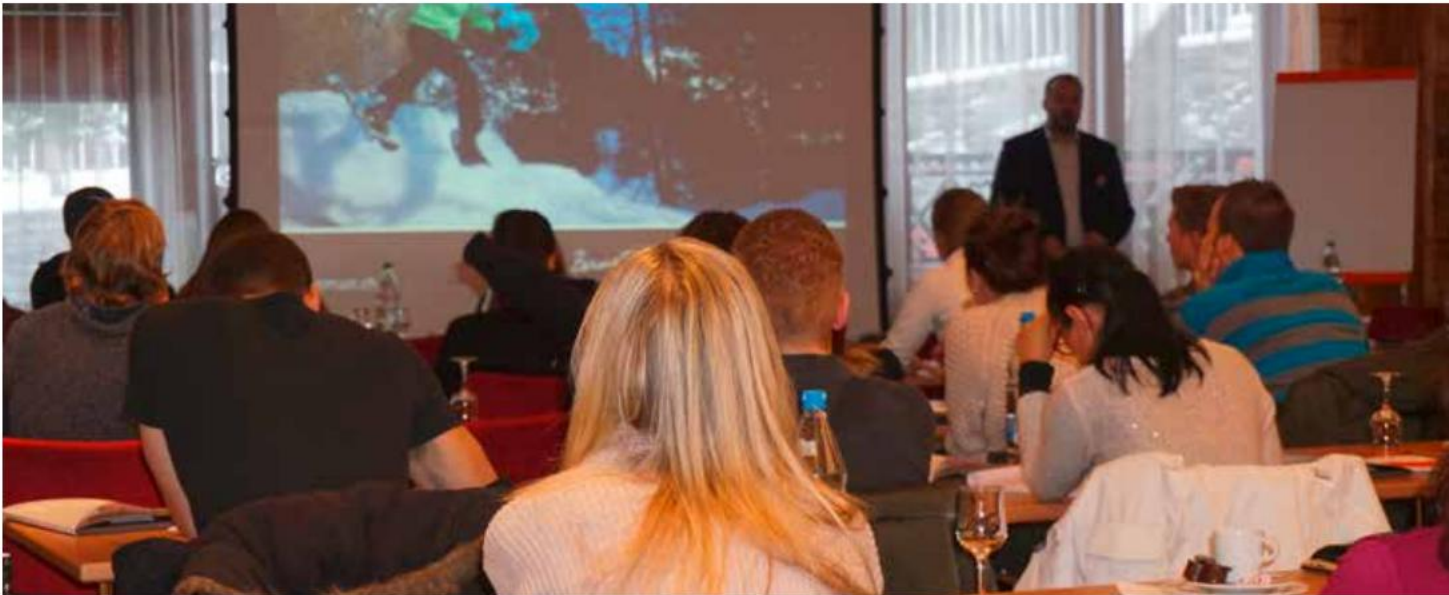
Zermatt Tourism will provide information on the new developments at the destination on December 14, 2017.

Zermatt Tourism will present information about the destination and news for the 2017/18 winter season for one hour at 9:00 a.m. and 2:00 p.m. Everyone is invited to attend. The event should be of particular interest to those who come into direct contact with guests. Registration is available at ztnet.ch .