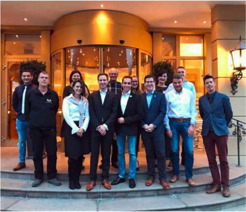
The Clefs d'Or Zermatt/Upper Valais association recently held its annual general meeting.