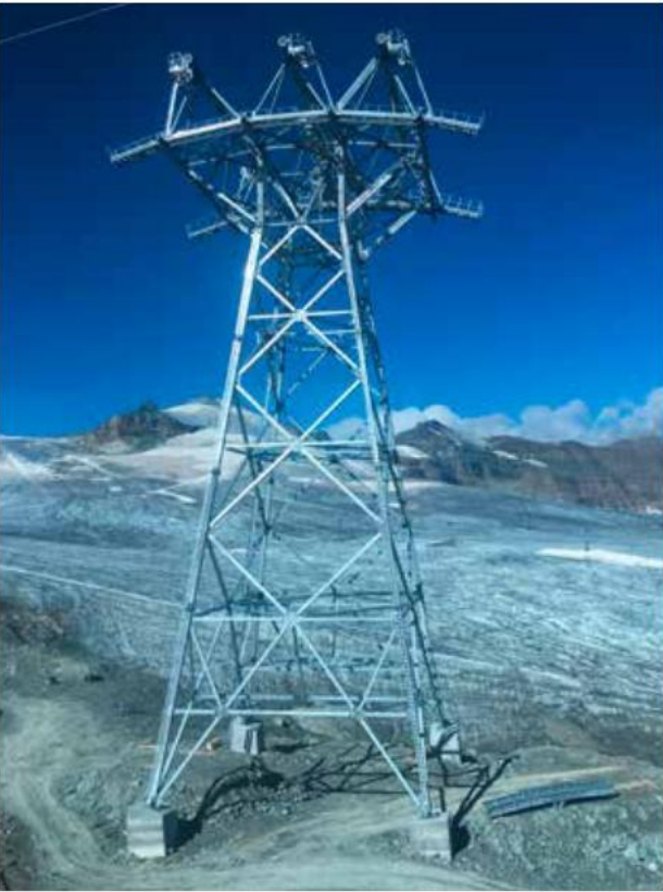
At the beginning of June 2017, the assembly of the second Support started.