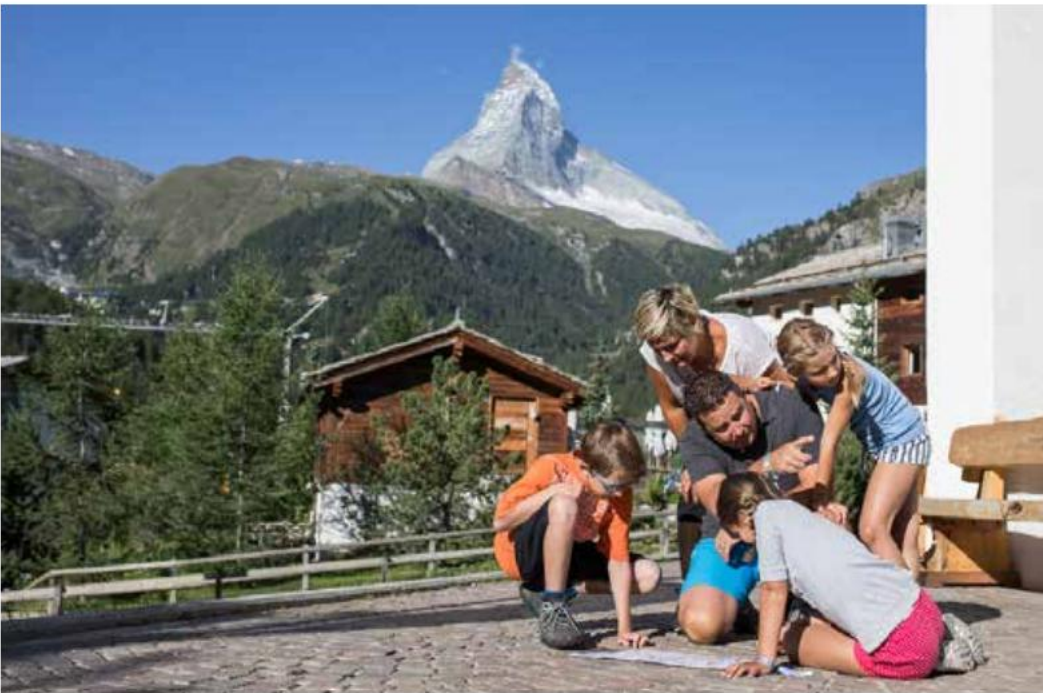
The whole family joins in on Wolli's treasure hunt.

For the whole family Wolli's Treasure Hunt lasts one to one and a half hours and is suitable for families with children ages 5 and up. Teenagers and accompanying adults are also sure to enjoy the tinkering and the route through Zermatt. Families discover the village in a special way – children's eyes light up.