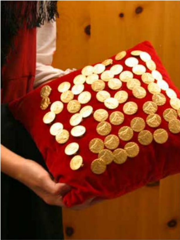
For the 20th, 40th or 50th anniversary, guests receive a medal of honor.

Available here. Guests celebrating their 20th, 40th, or 50th anniversary will be honored.