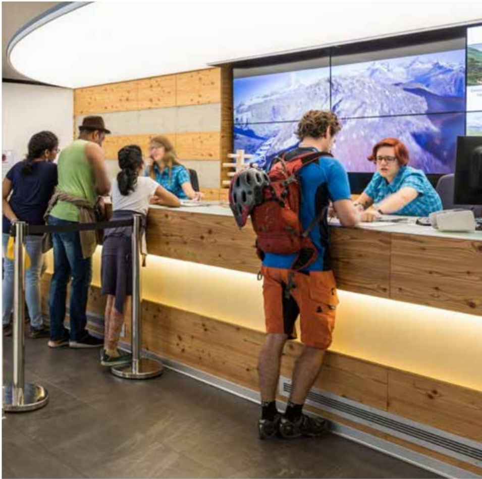
The Zermatt Tourist Office is now open daily from 8 a.m. to 8 p.m.