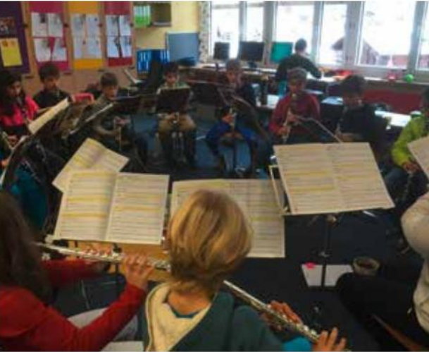
The children play music together in the class orchestra and get to know the whole spectrum of music.

At the beginning of the school year, the children got to know and try out all the instruments. They were supported and guided by music teachers from the General Music School of Upper Valais. After a few weeks, the final instrument assignments were made. To ensure a balanced sound, a balanced instrumentation was provided, including trumpets, trombones, clarinets, tubas, euphoniums, flutes, etc. They work according to a systematic learning program that includes playing music, singing, movement, breathing, blowing, and rhythm, and covers the goals of the music curriculum .