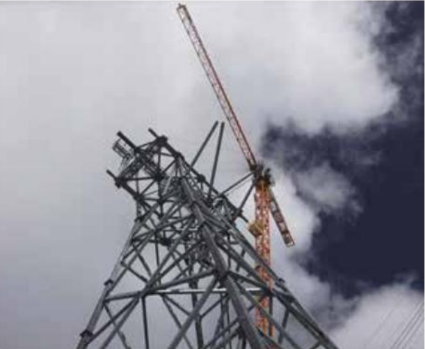
An additional 52-meter-high crane had to be used to assemble the third 40-meter-high steel column.