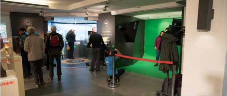
The Matterhorn PhotoShop at the Kulmhotel Gornergrat.

The Matterhorn PhotoShop is located in the shopping mall of the Kulmhotel Gornergrat and is open every day from 9:00 a.m. to 4:00 p.m.