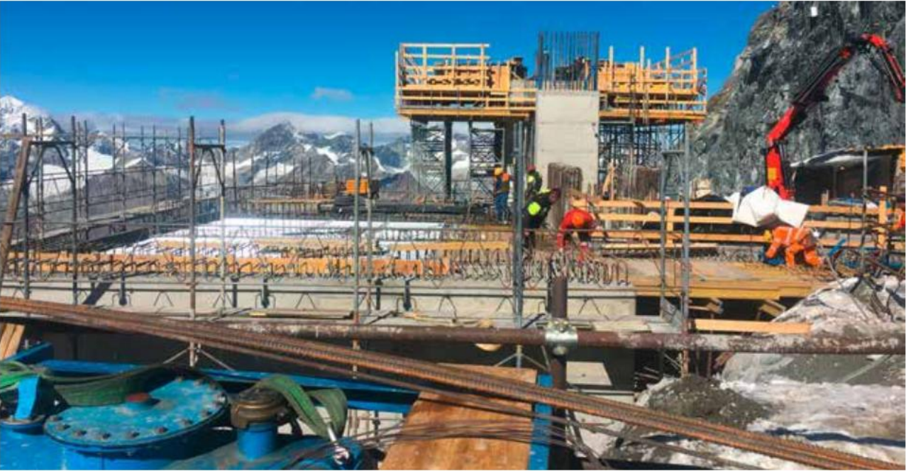
Construction work at the mountain station has progressed well, and assembly of the electronic system is about to begin. Nothing stands in the way next February.

With the completion of this second construction summer, all work is now on track and on schedule. Detailed articles on the individual construction phases can be found on the Zermatt Bergbahnen blog at "blog.matterhornparadise.ch."