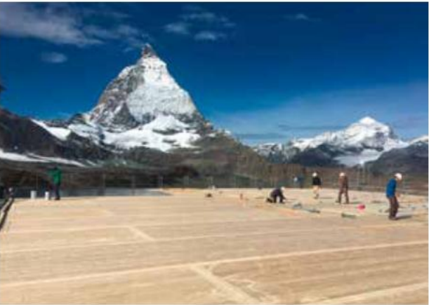
The first layer of roof waterproofing of the valley station has been relocated.