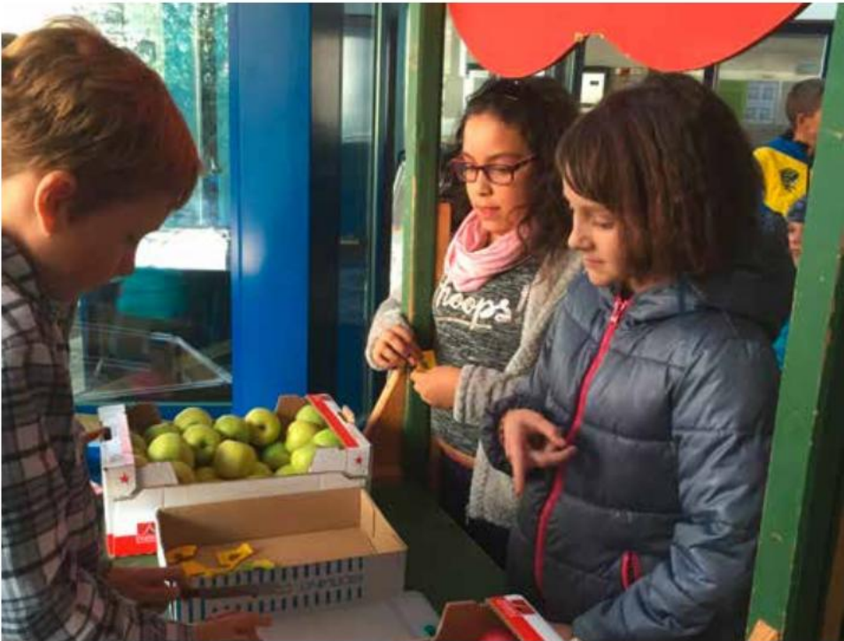
Apples are not only healthy, they also taste good, satisfying the small hunger between meals and quench your thirst.

Learning effect This example clearly demonstrates how the ecological cycle of bio-organic waste works and can be closed again. Each of us can make a contribution: Please help separate bio-organic waste and dispose of it at designated collection points.