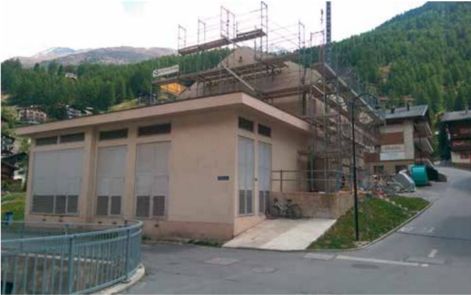
The Wiesti headquarters is currently undergoing extensive renovations, with completion scheduled for spring 2018. be completed.

With the new equipment, the power plant's annual electricity output remains roughly the same. The amount of water processed in the power plant, and thus also the electricity production, is limited by the current EWZ concession.