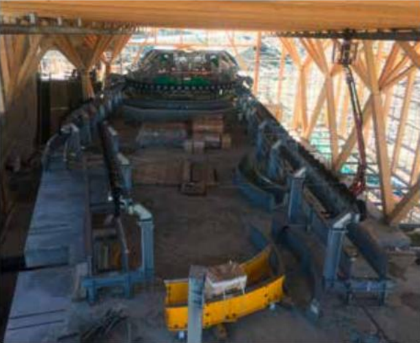
The wood assembly work in the valley station is successful been completed.