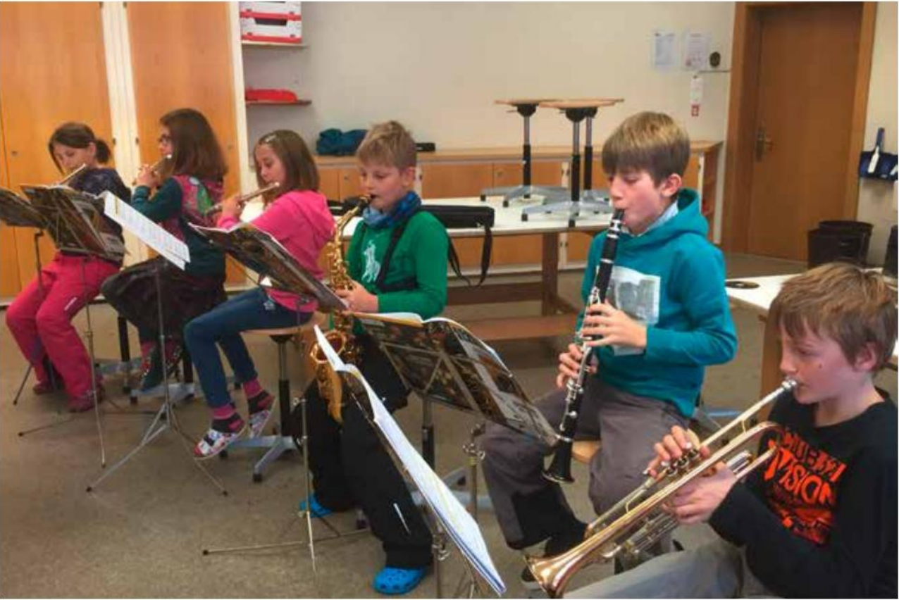
In the “wind instrument class,” each student learns a musical instrument from scratch.

The "Wind Instrument Class" offers children the opportunity to actively experience music – regardless of their family and social background. This project should not be confused with individual instruction or learning a musical instrument through the General Music School of Upper Valais. This valuable offering continues to exist. Additional information on individual lessons can be found on the website of the Allgemeine Musikschule Oberwallis: amovisp.ch.