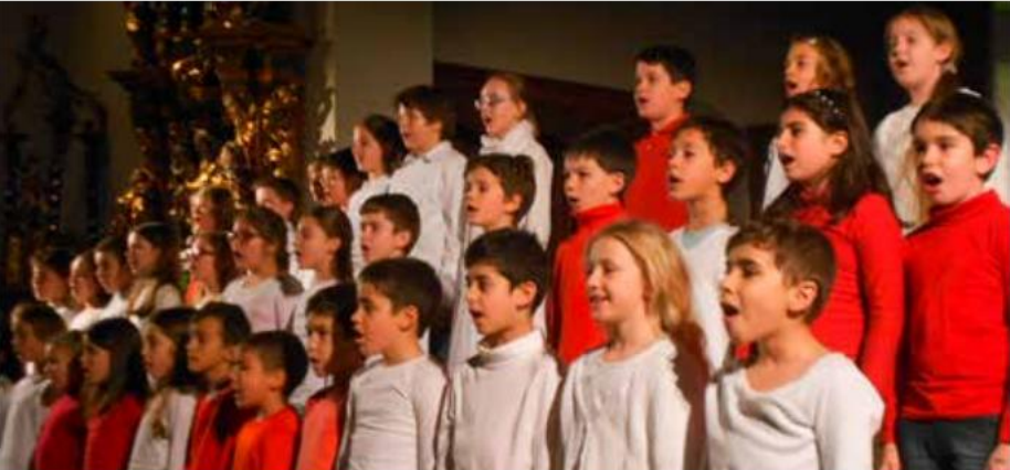
Kindergarten and primary school children show what they can do during two Advent concert performances.

Please reserve both dates in your calendar now.