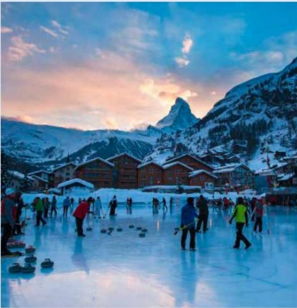
Popular with locals and visitors: open-air curling.

These are Mondays, starting at 7 p.m. The finals will take place on Saturday, January 13. 2018 starting at 10:00 a.m. Do you have a team together? Then register directly at: www.cczermatt.ch. We wish you a successful winter season and "good stone".