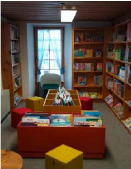
The Zermatt Library presents a selected Range of media for children available.

Christmas in the library During the Advent and Christmas season, you'll find thematically relevant reading material in the library . On December 22, 2017, we invite our patrons to enjoy a glass of warm wine in the library. Let's get into the Christmas spirit together. You can find more information about this event on the library's website.