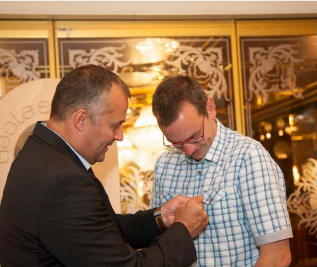
The spa director pins a medal on a regular guest.

The awards ceremony, which has been held since 1984, takes place every Thursday at 5:30 p.m. in a festive yet relaxed atmosphere at the Grand Hotel Zermatterhof, depending on the number of participants. The spa director or his deputy and a lady in traditional costume welcome the guests and share anecdotes about the guests being honored and the destination before calling them up individually, pinning on a medal of honor, and presenting them with a gift. Following the ceremony, which lasts 30 to 60 minutes, an aperitif is available for everyone. Of course, all hosts are cordially invited to accompany their guests.