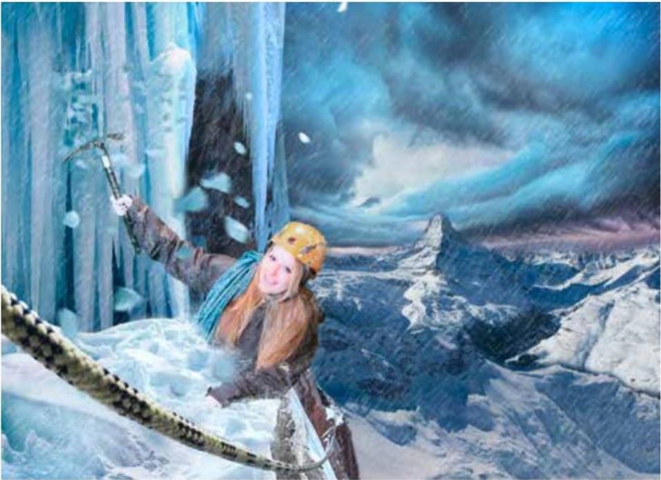
With the hyper-reality technique used by the photographers, the guest is presented in extraordinary situations.