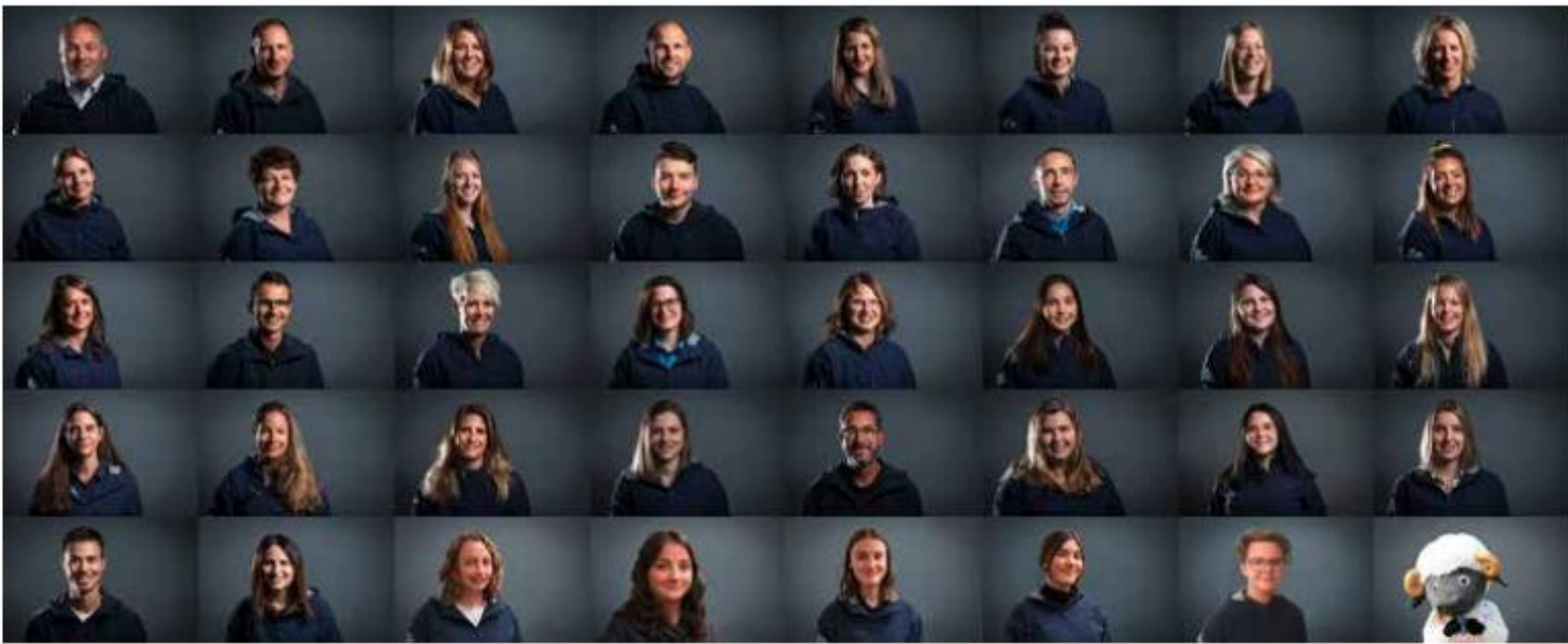
Team Zermatt Tourism 2021

will also be published continuously on the extranet www.ztnet.ch . Zermatt Tourism welcomes any feedback and suggestions from its members and service partners.