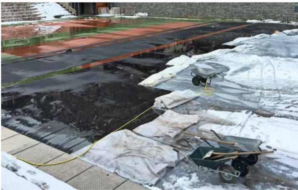
Cooling hoses during ice removal