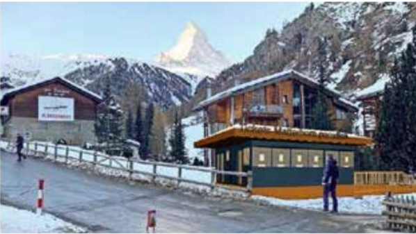
Between May and about mid-June, a temporary cash register constructed from container elements.

Demolition and excavation work on the valley station building around the Matterhorn Express.