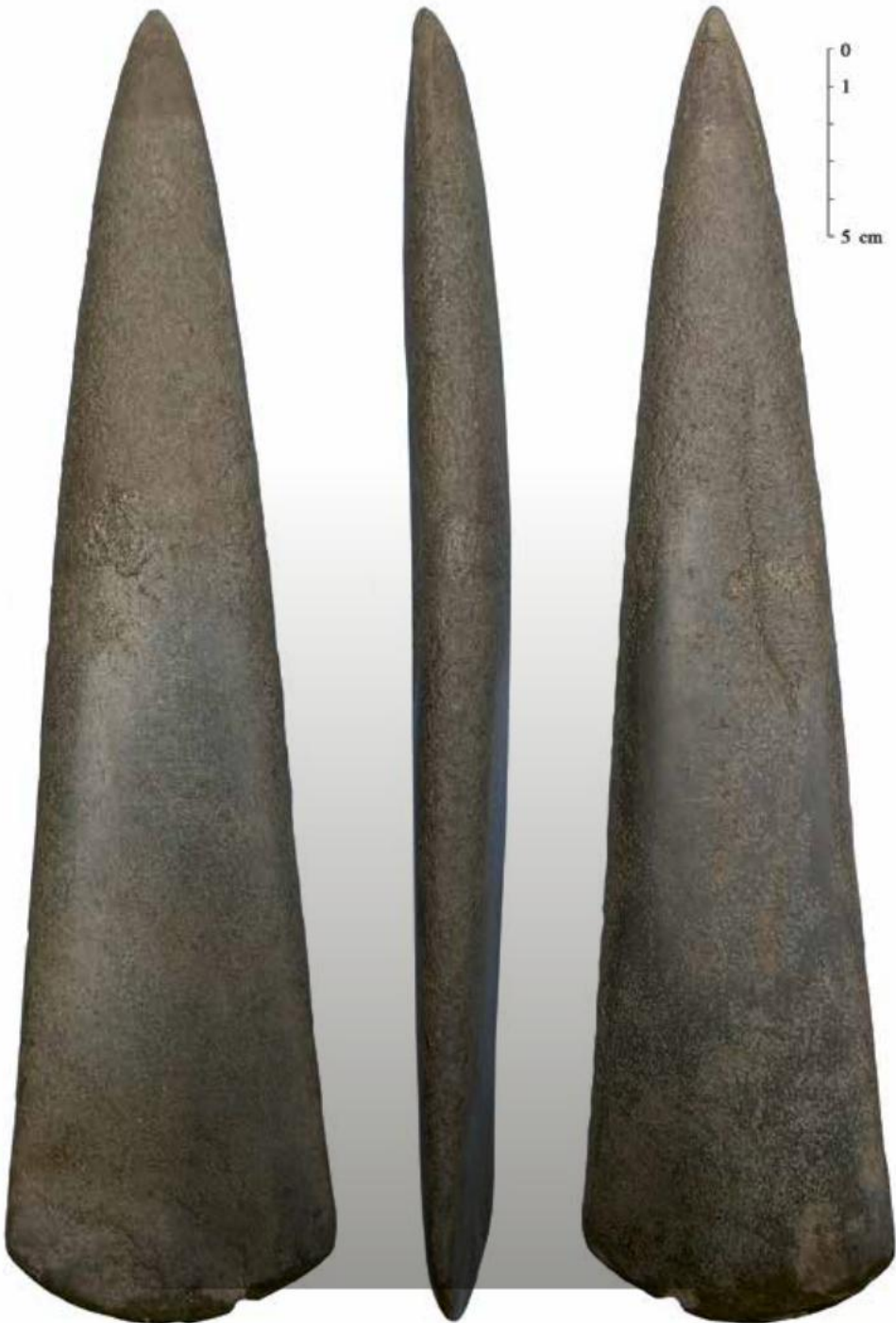
Neolithic axe from Monte Viso in northern Italy.

Home with the war chest Of particular interest are the more than 180 coins found. They allow for a precise dating of the mining accident. The most recent coin dates to 1600. Thus, the man must have died around or shortly after the turn of the century. The eight large silver coins from Milan, including one from Philip II (1554–1598), could indicate that the deceased was possibly in the service of northern Italy, presumably on his return journey to the Swiss Confederation. The remaining coins are small change from various regions, such as the Duchy of Savoy, the Margraviate of Messerano, but also from the cities of Solothurn, Lausanne, Chur, Salzburg, Friedberg, and Frankfurt.