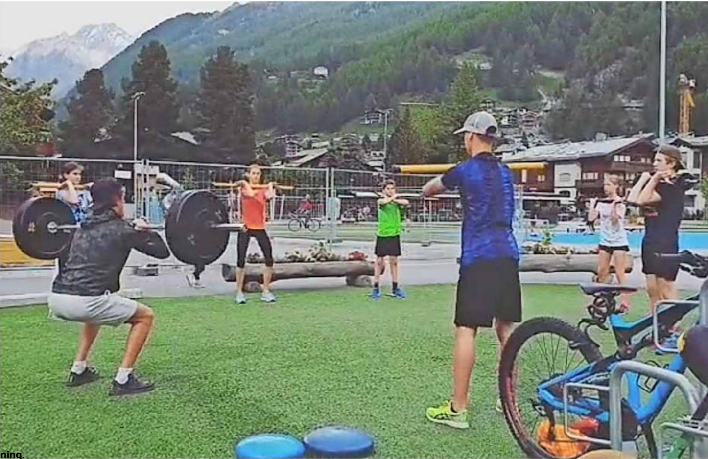
Participants of the Regional Performance Center Zermatt (RZL Zermatt) in training.

Website of the Youth Fund of the Municipality of Zermatt