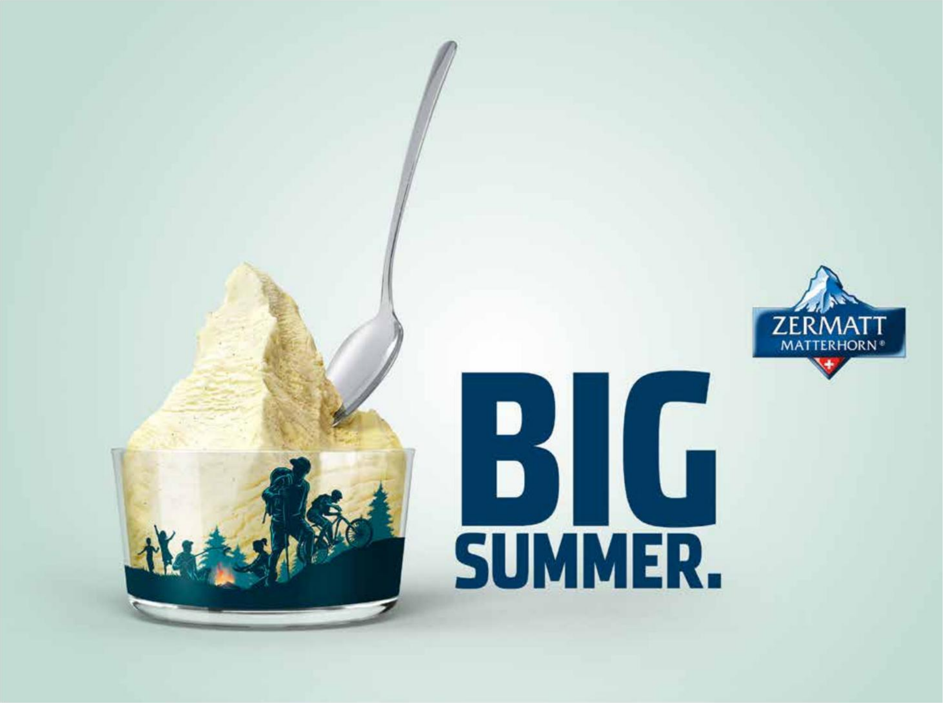
New colors, new design: Zermatt Tourism's BIG SUMMER campaign comes with some new features.

de and optimism for a BIG SUMMER in the destination Zermatt – Matterhorn.