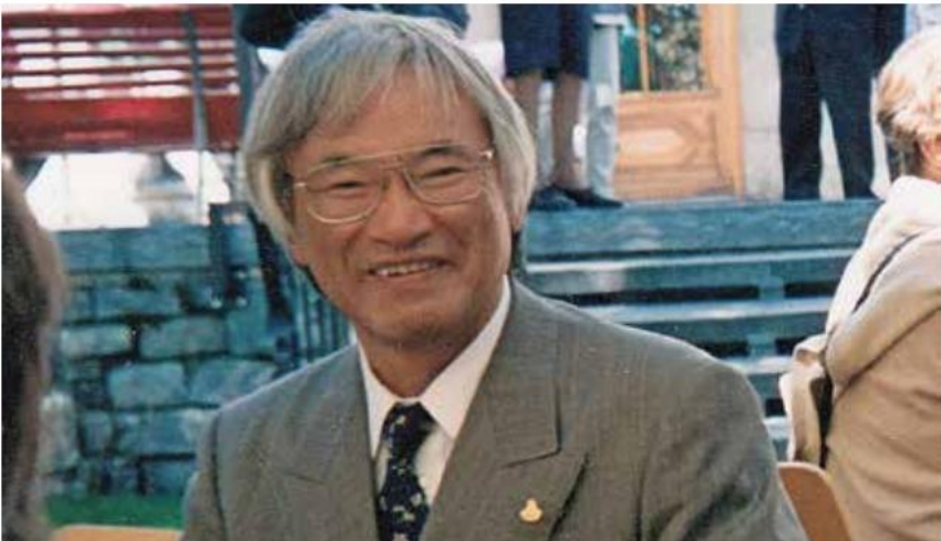
OS Zermatt and Junior High School Myoko City, November 2005, Myoko Corner