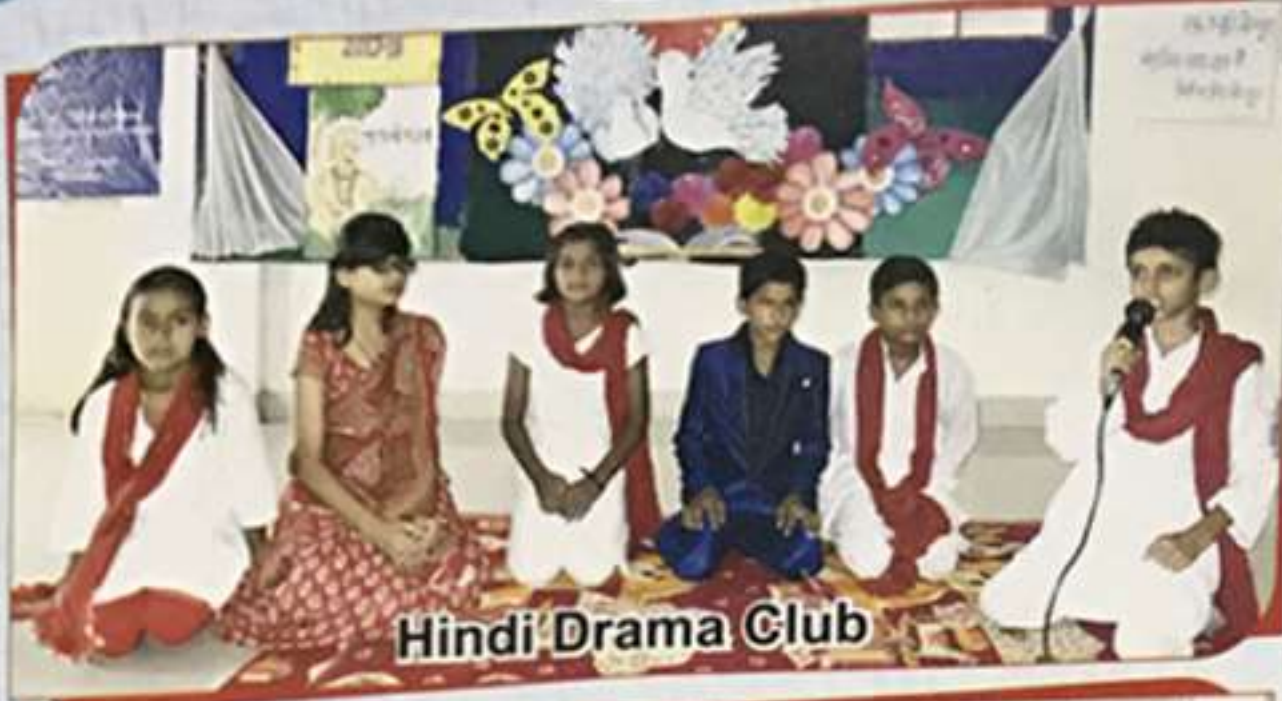
Hindi Drama Club