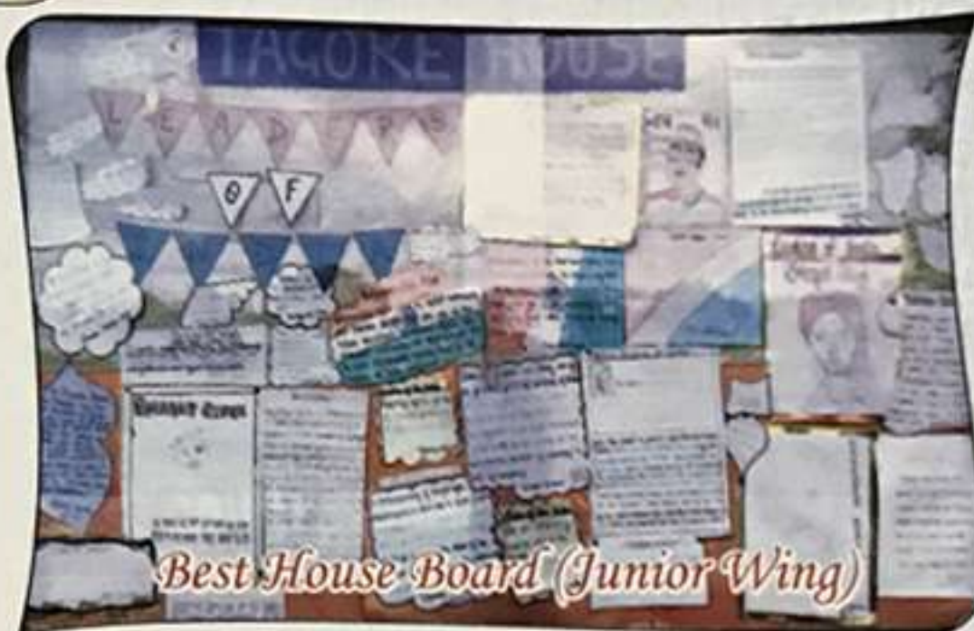
Best House Board (Junior Wing)