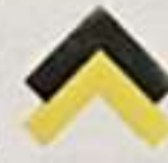
Non Teaching Staff