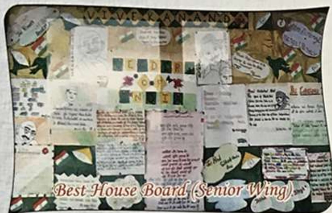
Best House Board (Senior Wing)