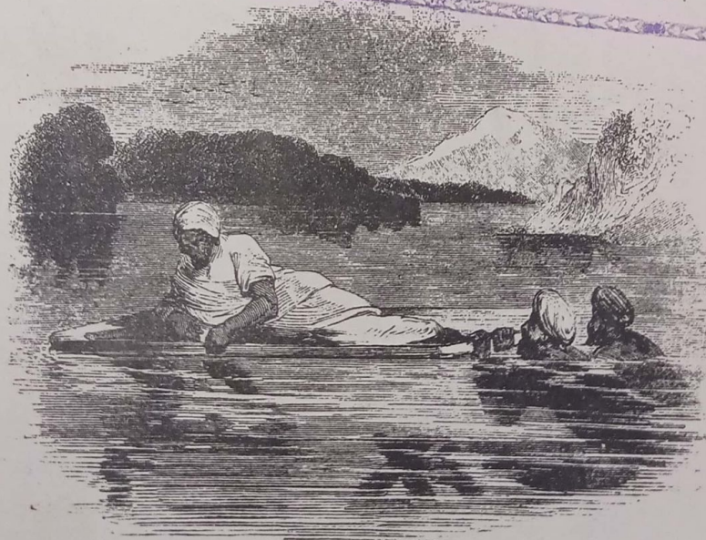
Method of crossing Rivers in the Panjab.